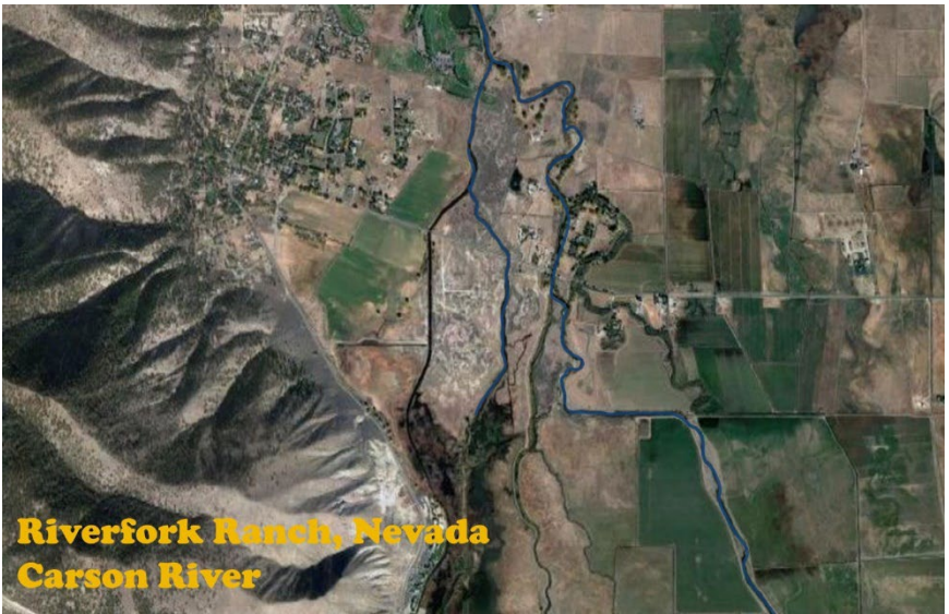
Riverfork Ranch, Nevada Carson River