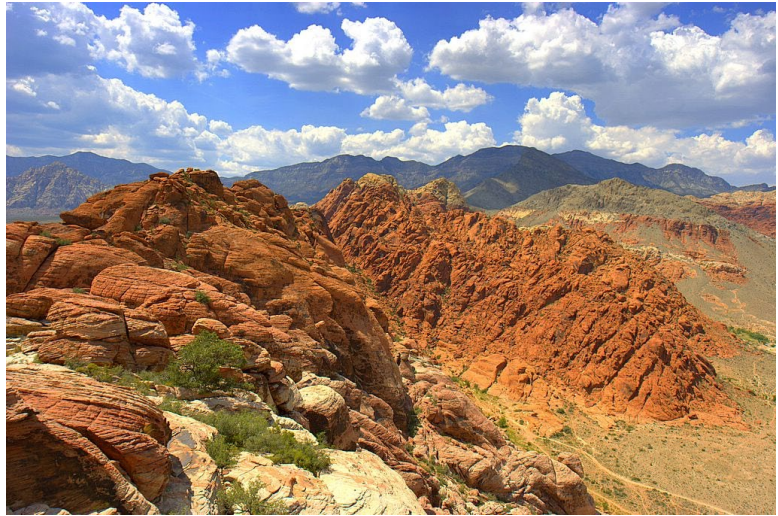
Mojave Desert

Dan is making his way across the Mojave Desert in search of something to eat. He comes across a large canyon filled with sand. It looks like many other animals have chosen to go around the pit to avoid struggling through the sand.